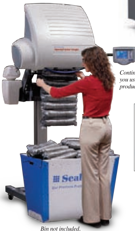
Bin not included.

Flexible Continuous Foam Tubes (CFTs) can be used to provide a base cushion or full wrap around. Insert blank film spaces between tubes to provide Instapak® protection only where needed.